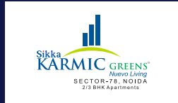
Sikka Karmic Greens Sector 78, Noida