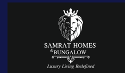
Sector 79, Noida