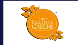
Sikka Kaamna Greens Sector 143A, Noida