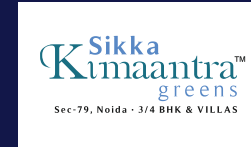
Sikka Kimaantra Greens Sector 79, Noida