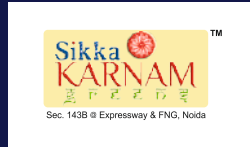
Sikka Karnam Greens Sec-143B, Noida