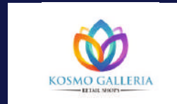
Sec-143 A Expressway & FNG, Noida