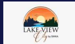
Bhagwanpur, Roorkee (Uttarakhand)