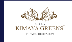
Sikka Kimaya Greens Doon IT Park, Aman Vihar, Dehradun, Uttarakhand 248001